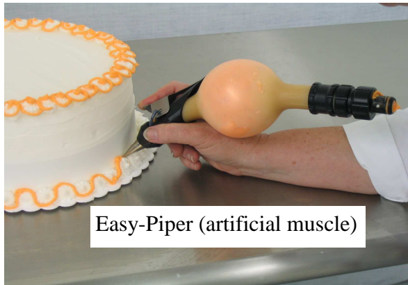
Easy-Piper (artificial muscle)